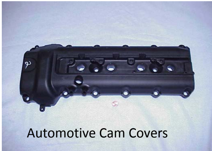
Automotive Cam Covers

Features a nice balance of high temperature engineering properties for leak proof sealing and good aesthetics to please the pickiest stylists.